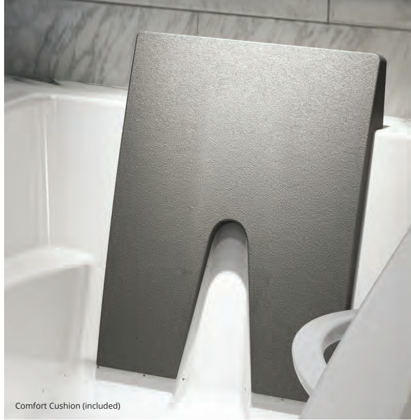
Comfort Cushion (included)