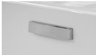
Rectangular overflow included

Slim-Line Overflow with Toe Tap Drain Solid Brass Drain Chrome (SLOTSBC) $930 Brushed Nickel (SLOTSBBN) $935 Polished Nickel (SLOTSBPN) $935 White (SLOTSBW) $965