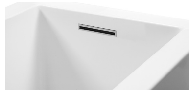
Optional Slim-Line overflow